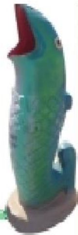
17. Cap - 100.00 H: 4'3"