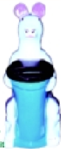
15. H: 4'2" Cap - 175.00