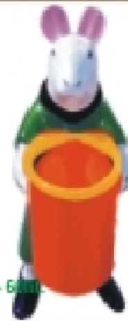
21. Cap - 60.00 H: 3'3"