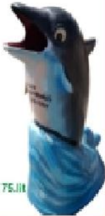
18. Cap - 75.00 H: 4'