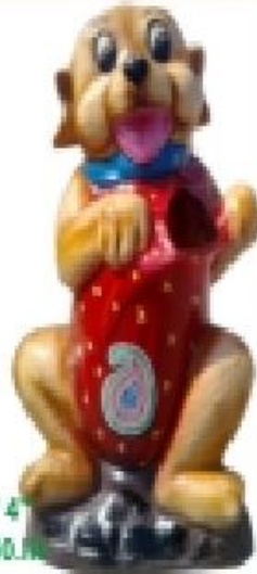
16. H: 3'4" Cap - 150.00